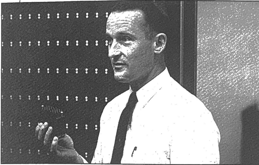
Seymour R. Cray holding a component of the 7600 computer, ca. 1968 (P447).