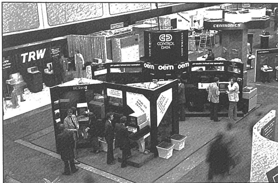
A trade show display of Control Data Canada, Ltd. Probably in Toronto, ca. 1979.

1957 Company incorporated (July 8) with headquarters at 501 Park, Minneapolis; acquired Cedar Engineering. 1958 Received first order for 1604 computer; "Little Character," 1/10-scale prototype of 1604, is operational; Sperry Rand sues CDC. 1959 Delivered air traffic control display. 1960 Delivered 1604 and 160 computers; acquired Control Corp.; established first CDC data center (Minneapolis). 1961 Delivered 160A and 924; established new computing center in San Francisco; awarded $5 million contract for fire control computer for Polaris Submarines; net sales = $19,783,745. 1962 Delivered Polaris computer, 606 tape transport, and 166 line printer; opened European office in Lucerne, Switzerland; moved to new headquarters building in Bloomington, MN; Sperry Rand lawsuit settled out of court. 1963 Delivered 3600 computer, 603 tape drive, 405 card reader; acquired Beck's, Inc., Computer Division of Bendix Corporation, Control Systems Division of Daystrom, Digigraphic Systems of Itek. 1964 Delivered 501 Line printer, 3200 computer; acquired Rabinow Engineering, Transactor business (General Time), Holley Computer Products, Bridge, Inc., Computer Laboratories, Inc., Adcomp Corp., TRG Inc; 1965 Delivered 3100, 6600; acquired